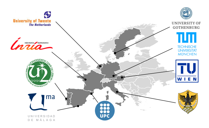
Fig. 1. Participant countries.

expressed by the community were the triggers for the study described in this paper.