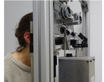
Instrument coupled to a phoropter