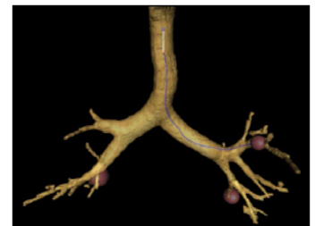
Path to the peripheral lung lesion