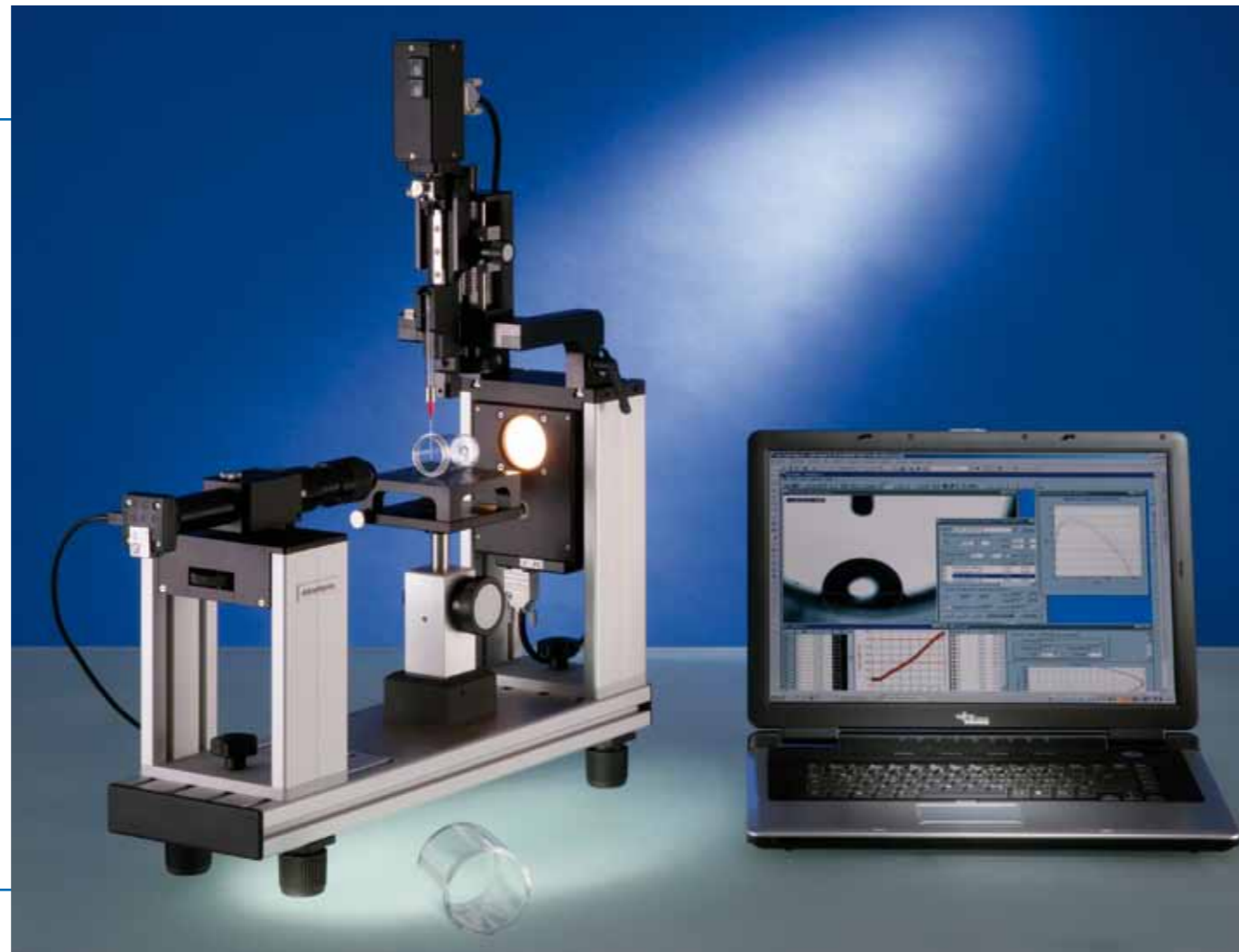
OCA 15EC with SD-DM single direct dosing system and ES/2-D electronic dosing unit