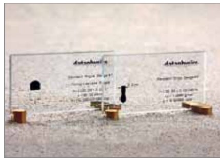
OCAS with standard drop contours