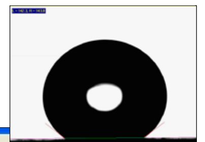
Water drop on an ultrahydrophobic substrate