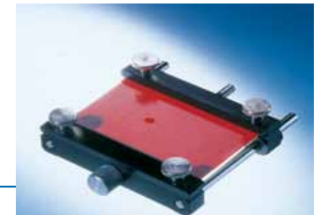
FSC 80 film sample holder

DataPhysics is specialised in the development of high-precise and reliable methods for evaluating drop contours in combination with statistical error analysis. The SCA software assists you in the intuitive use of the video-based optical contact angle measuring instrument OCA 15EC by specifying measurement procedures and in collecting, assessing, and evaluating the measured data. The SCA software is designed as a modular program for all OCA instruments. Under Windows 7® and Windows Vista® it works in 32- and also in 64-bit mode; under Windows XP® /SP3 only in 32-bit mode.